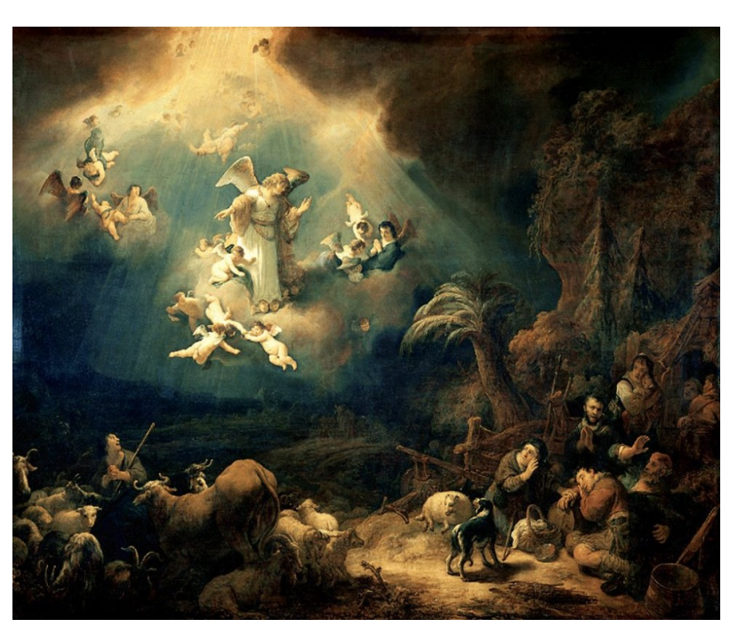
Angels Announcing the Birth of Christ to the Shepherds, by Govert Flinck, 1639, The Louvre, Paris

As a church family, we strive to connect people to God and to one another as we follow Christ.