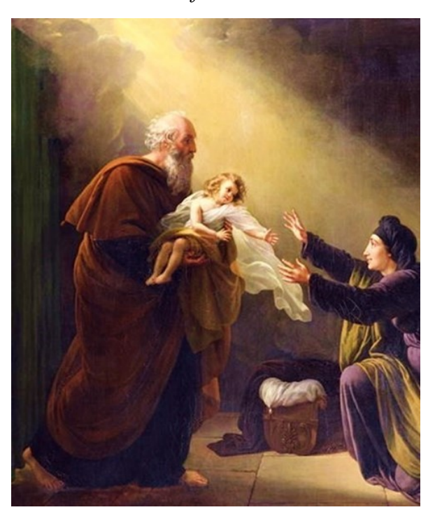
"Elijah Resuscitating the Son of the Widow of Zarephath" by Louis Hersent (1819) Oil on canvas Algers, Musee des Beaux-Arts

As a church family, we strive to connect people to God and to one another as we follow Christ.