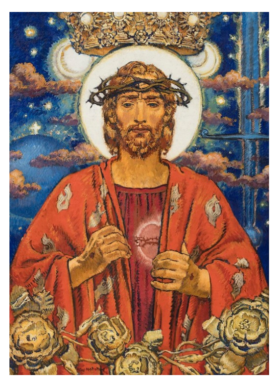
"The Heart of Jesus (Christ the King)," by Jozef Mehoffer 1930, Oil on canvas, Warsaw, Poland

As a church family, we strive to connect people to God and to one another as we follow Christ.