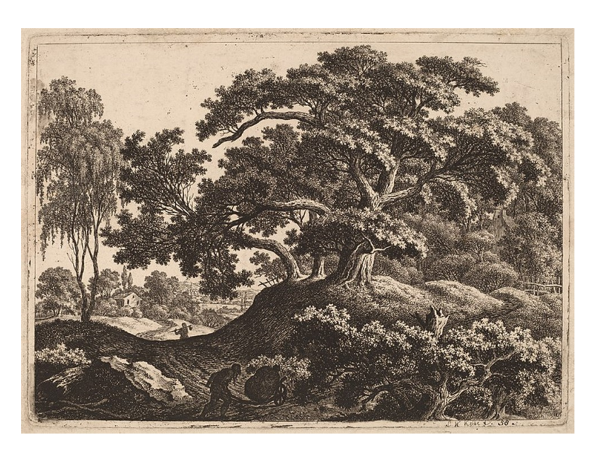
"Landscape with Man Pushing a Cart" (1797), by Carl Wilhelm Kolbe, etching on paper, National Gallery of Art, Washington, D.C.

As a church family, we strive to connect people to God and to one another as we follow Christ.